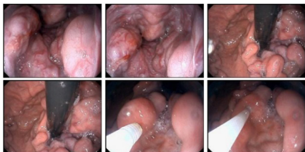
Figure 3. Histoacryl injection sclerotherapy

After the bleeding stop and hemodynamic was stable, propranolol 2x20 mg was given to prevent rebleeding. No anticoagulation was given because the registro informatizado de enfermedad tromboembolica (RIETE) score was equivalent to a moderate risk (2.8%) for major bleeding. Finally, hystoacryl injection sclerotherapy were performed. After hystoacryl injection sclerotherapy, the bleeding was controlled.